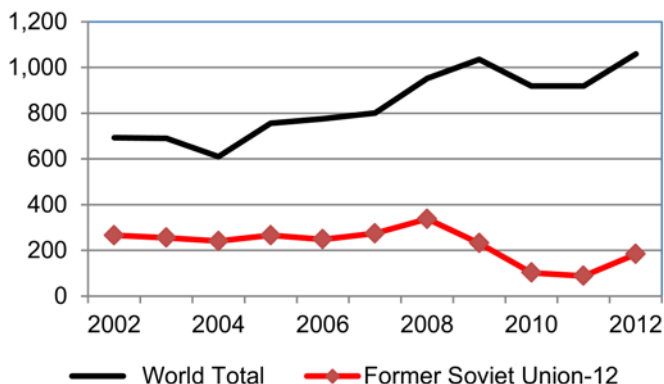
January- April Cumulative U.S. Broiler Meat Exports World Total & Former Soviet Union Comparisons (Thousand Metric Tons)