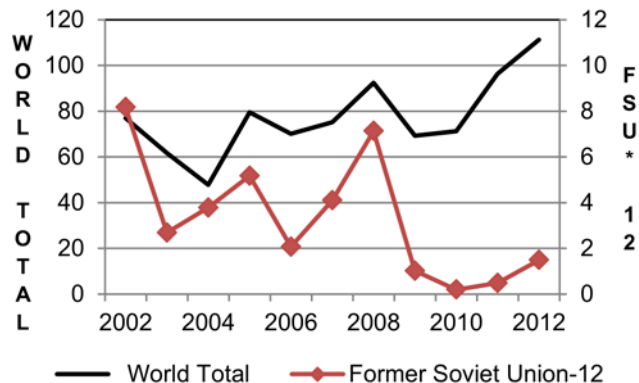
January- April U.S. Turkey Meat Exports World Total & Former Soviet Union-12 Comparisons (Thousand Metric Tons)